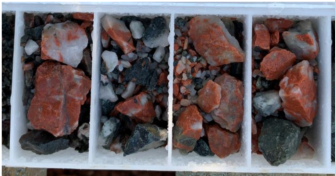
Figure 2 Quartz Adularia Veining from RC drilling at reconnaissance target in the Central Dome area (KMRC227: 26-30m)

Drilling of the newly discovered anomalously mineralized veins (during 2019 reconnaissance work) has commenced with a total of 22 holes for 1,300m proposed. Drilling has been completed at the Central Dome and Camp North areas (Figure 3) with significant structure and quartz adularia veining intersected at both locations (Figure 2). Assays are pending.