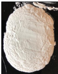
High purity Titanium Dioxide 99.5% TiO_2

To extract a Titanium Dioxide product, the leachate was heated under reflux and distillation conditions to promote the hydrothermal precipitation of Titanium Dioxide, followed by purification steps to produce a high purity 99.5% TiO_2 product (KRC ASX announcement 30 January 2018) as shown below.