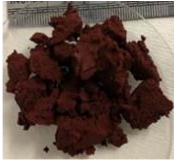
High purity Vanadium Pentoxide 99.48% V_2O_5

Stage 3 purified the vanadium product using dilute HCl to remove contaminants and precipitated a brown high purity Vanadium Pentoxide product assaying 99.48% V_2O_5 , 0.29% Fe_2O_3 and 0.17% Na_2O .